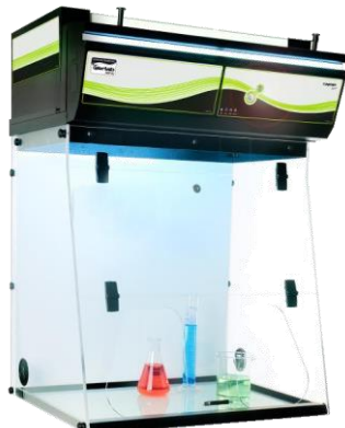
321 Smart Hood