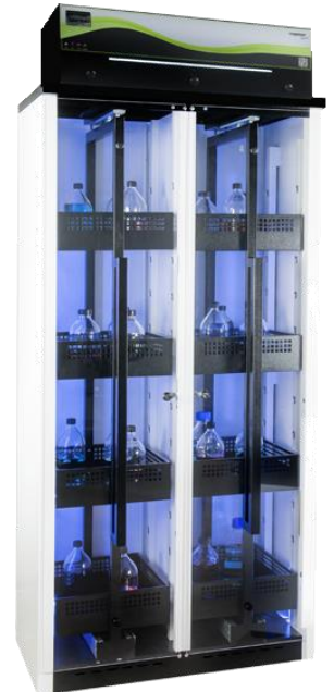
832 Smart Cabinet