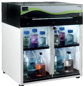
822B Smart Cabinet